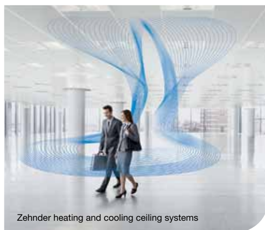
Zehnder heating and cooling ceiling systems