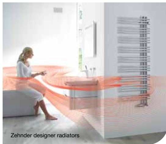
Zehnder designer radiators