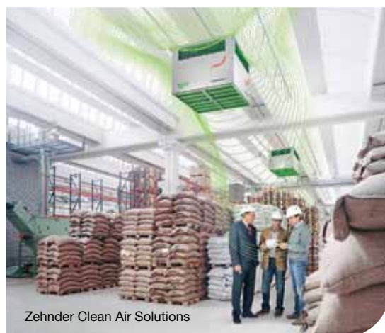
Zehnder Clean Air Solutions